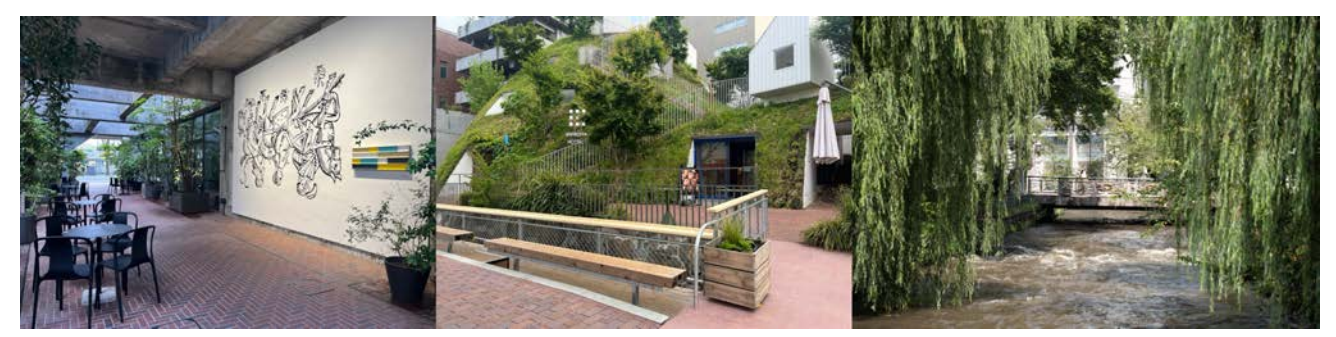
(left) Shiroiya Hotel Passage (middle) Benches in front of Shiroiya Hotel by the Babbakawa River (Right) Hirose River