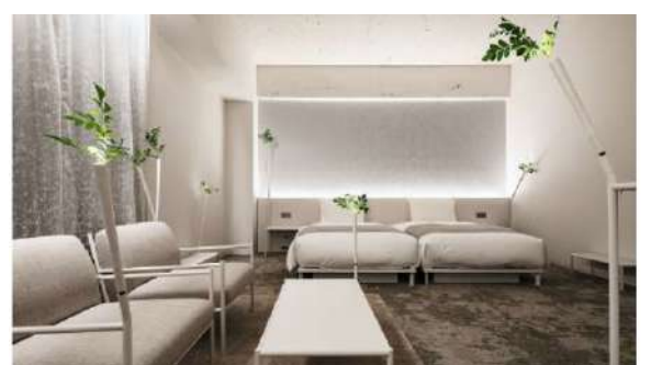
The SOU FUJIMOTO ROOM