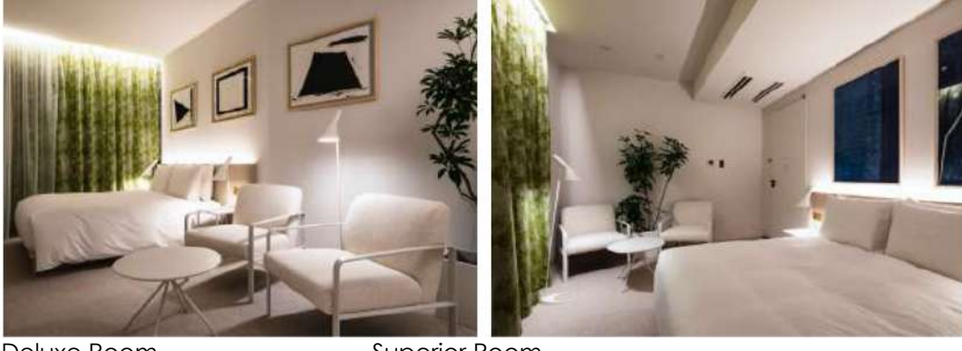
Deluxe Room