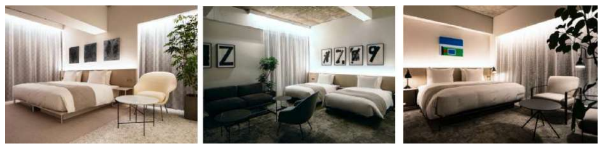
Junior Suite Room