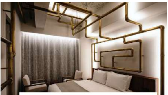
The LEANDRO ERLICH ROOM