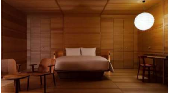
The JASPER MORRISON ROOM